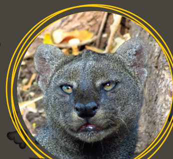
Jaguarundi ( Herpailurus yagouaroundi )