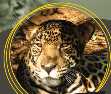
Jaguar ( Panthera onca )