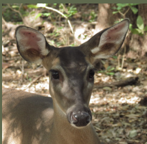
White-tailed Deer ( Odocoileus virginianus )