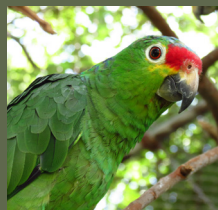
Red-lored Parrot ( Amazona autumnalis )