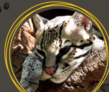
Ocelot ( Leopardus pardalis )