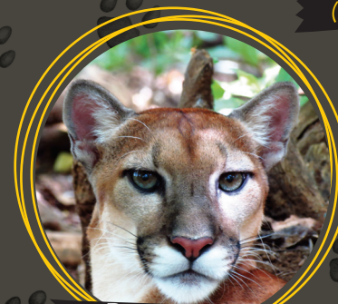
Puma ( Puma concolor )