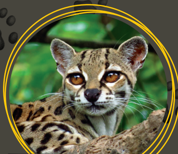
Margay ( Leopardus wiedii )

The Sanctuary is home to five of the six species of wild cats of Costa Rica. It also provides space for white-faced and spider monkeys, white-tailed deer, peccaries, and also three species of parrots, scarlet macaw and keel-billed toucan. 🐾