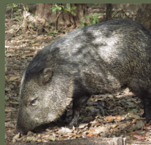
Pecari ( Pecari tajacu )